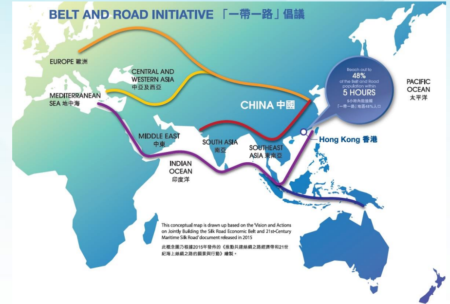
The Belt and Road Initiative - A road map to THE FUTURE, HKTDC website